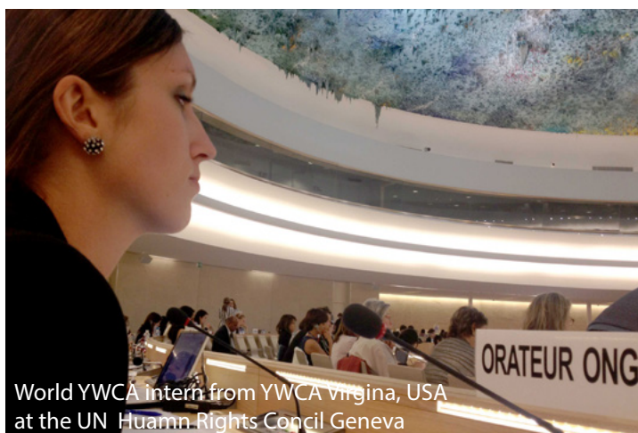
World YWCA intern from YWCA Virginia, USA at the UN Human Rights Council Geneva

The internship is an excellent opportunity for young women interested in communications. You will have the opportunity to assist in a range of communications projects, including media relations, message development, publications, event management, planning and managing social media.