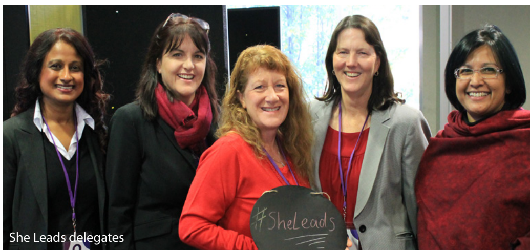
She Leads delegates