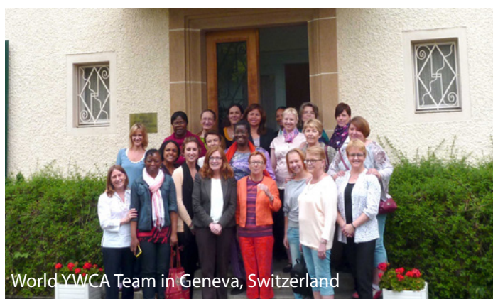
World YWCA Team in Geneva, Switzerland

The one-year Internship Programme (February to December, 2015) will provide a special opportunity for two young women to work as part of the World YWCA staff and volunteer team in Geneva. One intern will be afforded the opportunity to work as part of the communications team, and the other a part of the programmatic team.