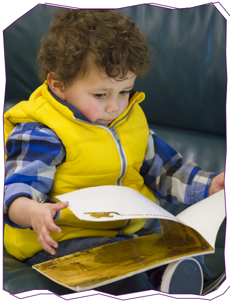
Photos left and top right :Campbell Cottage Educators and children; bottom right: New Campbell Cottage facilities

reminded us all of the importance of early childhood education and care with her supportive and inspiring words. We came together to celebrate all that we have achieved, share in the centre's history and look forward to the future in what is most definitely a beautiful new centre.